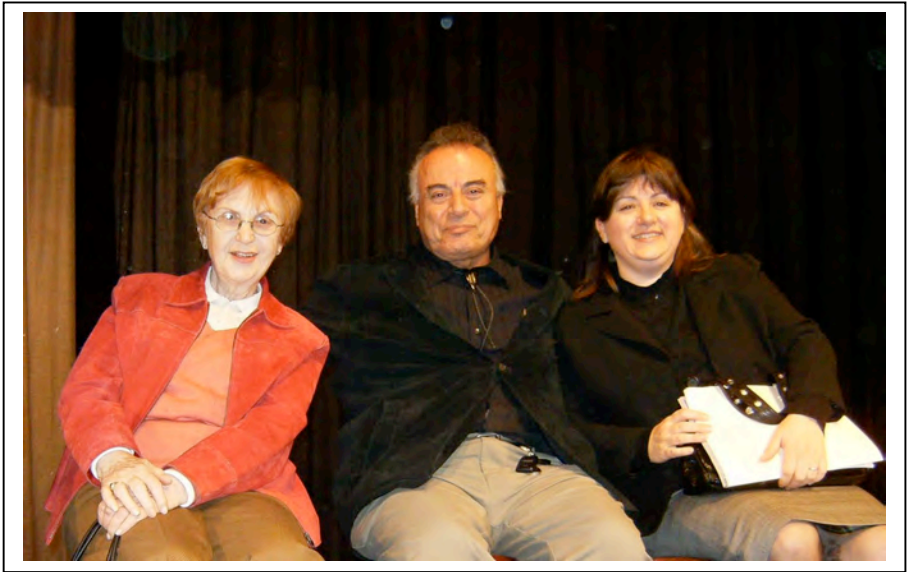
PREVENT HATE's presenters: Overcoming Genocide